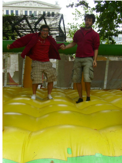
An adventure also for an Intern

months. As I am also studying teaching, I thought this a great opportunity for me. It was then settled that I would work for them.