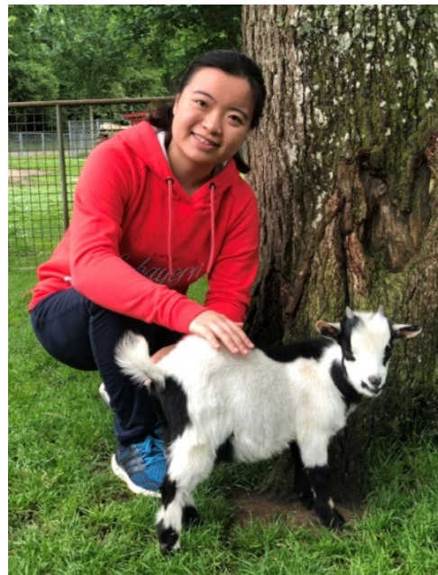
During a trip in a zoo garden

applications of the biosensor technology. After my internship, I have mastered the skills in using the biosensor set up as well as using excel to analyze the acquired results.