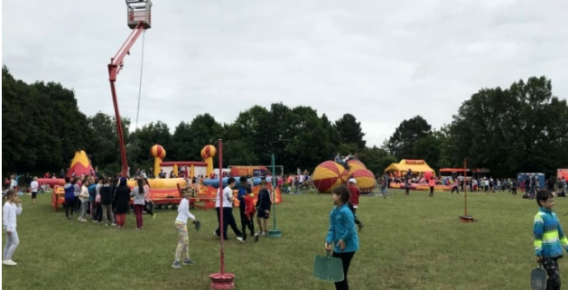
This is the first larger event I attended with ASP. It was called Schulsportfest and it celebrated the children's last day of school before summer vacation.

different languages. It made my language loving heart so happy. It was interesting to connect with people who were also learning German and being able to relate on that level.