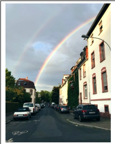
This is one of my favorite photos from the summer. Back home, summers are filled with rain and thunder-storms. I missed the weather back home, especially during Frankfurt's unexpectedly hot and dry summer this year. This is a photo after one of the few rain showers we

After the Mainspiele concluded, we had a little time to prepare for the next event Opernspiele . It was similar to Mainspiele , but it was next to Frankfurt's beautiful Alte Oper . Festivals were always a little chaotic, but I was excited to work at the Opernspiele , because working with children was always the highlight of my job. This time, I primarily worked at the arts and crafts tent. By this time my German and my confidence in my skills had improved significantly, and I helped the children pick out which craft they would like to make and help them problem solve if they needed assistance.